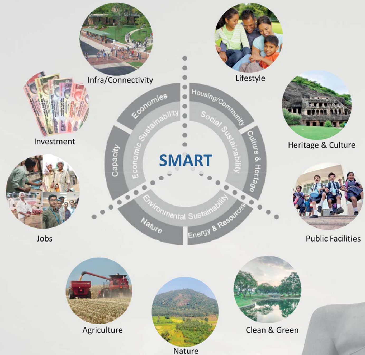
Fig.5.1 Urban Sustainability Framework

Besides identifying key sustainability issues, the framework will also set the sustainability targets and Key Performance Indicators (KPI's) for the city's long term development. The sustainability targets form the overarching parameters to be achieved through the implementation of the master plan in the next 20 and 40 years.